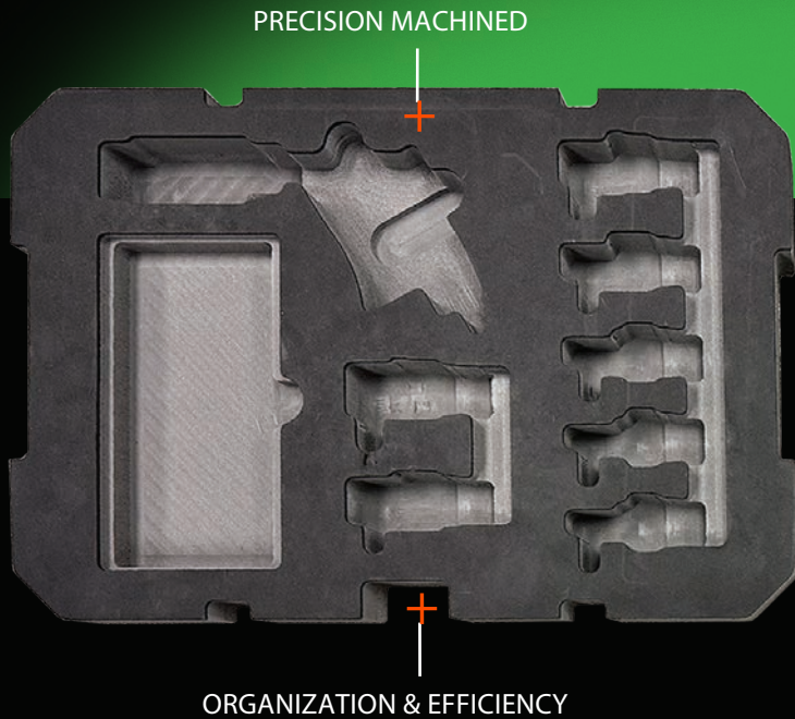
Lineaset Cleaner Foam Storage Tray HLCFOAM